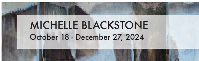
MICHELLE BLACKSTONE October 18 - December 27, 2024