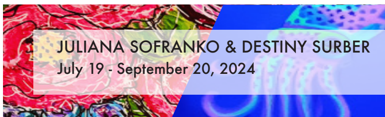
JULIANA SOFRANKO & DESTINY SURBER July 19 - September 20, 2024